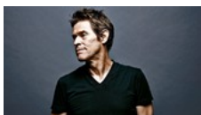
Willem Dafoe, Man of Action