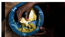
Smart Aid for the World's Poor