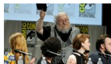
5 Takeaways from Comic-Con's 'Game of Thrones' Panel