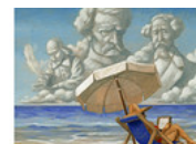
Books That Can Boost Your Portfolio