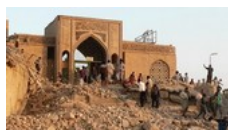
Islamic State Erases Iraq's Cultural Heritage